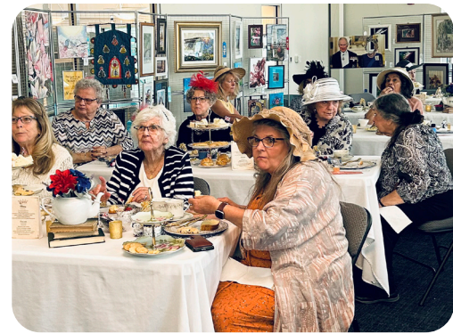
The Friends held a traditional English-style coronation tea fundraiser this spring, their first event of this kind

We invite you to join the Friends of Ritter Public Library. We welcome your talents, ideas and desire to support the jewel of